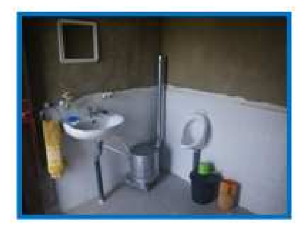
Fig. 3: Wash-hand basin and urinoire

It is composed of two pits functioning alternatively (Fig. 2); a wash-hand basin as well as an urinoire and shower (Fig. 3).