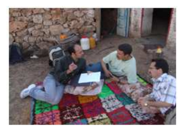
Fig. 7: Interviews with a household head