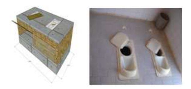
Fig. 2: Two pits functioning alternatively