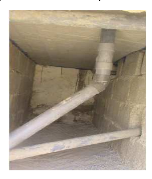
Fig. 5: Pit in construction sheltering various pipings

The fresh excrement will be covered with a mixture of ash as a better additive at destruction of Escherichia coli and Enterococcus spp (Niwagaba et al. , 2009). When the pit is full after approximately a year of use, it will be covered by the wooden lid in order that its contents mineralize.