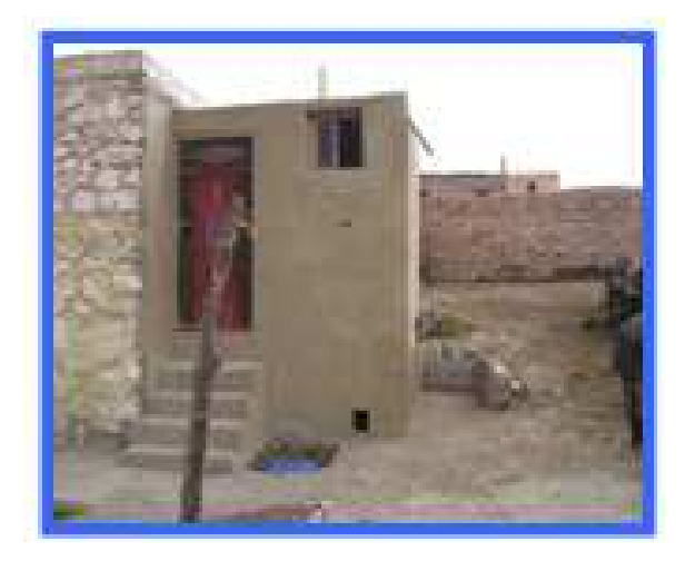
Fig. 6: UDDT built in June 2009

This publication highlights the ecosan promotion strategies and policies for its adoption by the future ecosan users in Morocco. It seeks: