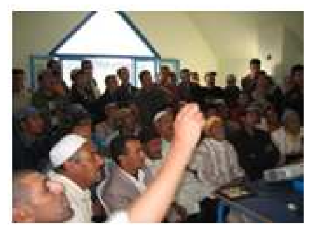
Fig. 9: Meetings of sensitizing of the population

Meetings of recommendation and decision making: In this rural area and at the beneficiary households, there were obvious relationships between UDDT adoption and the agricultural factors and attitudes towards wastewater treatment. They are rural families that defecate in nature. They are thus convinced of association between the property of the UDDT as a technique of collecting and treating wastewater and the conviction to re-use the human excrement (faeces and urine) in agriculture, which would allow on the one hand to protect public health and, on the other, to provide hygienically healthy products for agriculture. For these reasons, the adoption and the promotion of an ecological sanitation in the rural world, where the requirement of fertilizing is strongly expressed, are very welcomed.