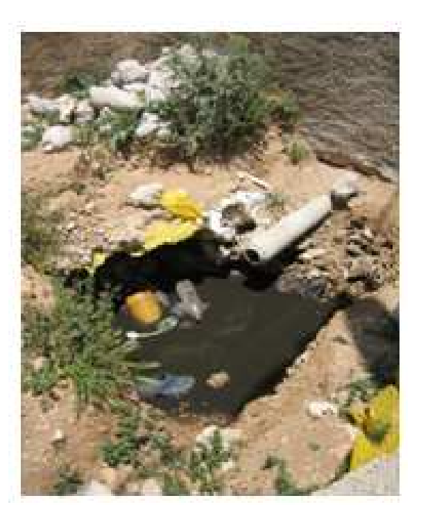
Fig. 8: Lost well used in Dayet Ifrah

The present research on ecosan in Dayet Ifrah consequently met the approval of the population majority and it was necessary to define clear strategies to identify people who could receive the experimental UDDT.