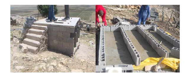
Fig. 1: 1st UDDT in Morocco built in December 2009