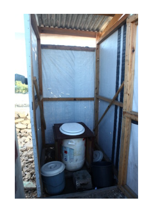
Photograph 4. Non-separating children's compost toilet