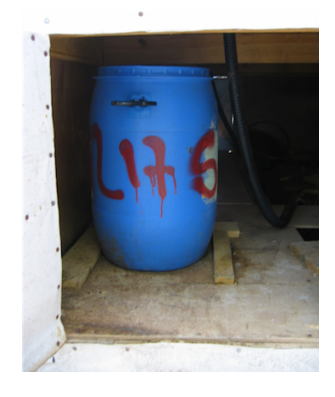
Photograph 2. 15-gallon drum with wooden guides.