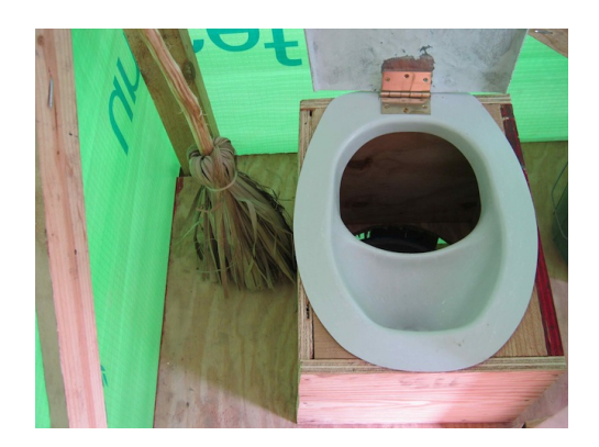
Photograph 3. Fibreglass UD seat made in Port au Prince