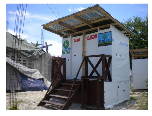
Photograph 1. SOIL UD Toilet, Jan 2011.